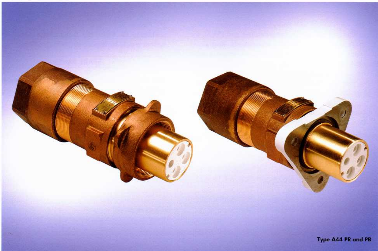
Type A44 PR and PB